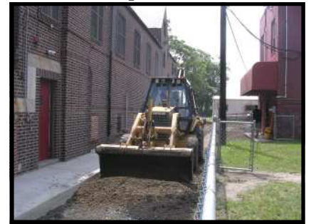
Brand new sidewalk and driveway.

The week between the end of the Summer Enrichment Program and the beginning of Preschool is usually a quiet one, but this year the welcome sound of jackhammers and bulldozers filled the Center's parking area. The result is a prominent sidewalk down the length of the main building and a new driveway where potholes and gravel used to be. This is the first of many such plans to improve the Center's aging facility.