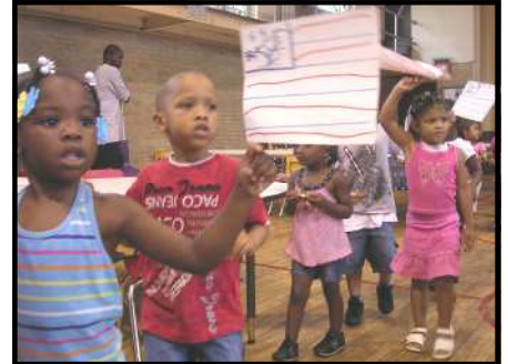
Preschool July 4th parade marches on despite stormy weather.

There are a few traditions at the Center that can be relied on to take place from year to year. The 4th of July Parade of Independence is one of these traditions. The children created flags and waved them proudly as they marched throughout the building. Those who didn't carry flags played instruments to add music to the event.