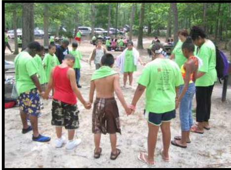
A day trip to Bass River begins with prayer.

This year's Summer Enrichment Program Closing Ceremony was a fitting ending to a record-breaking