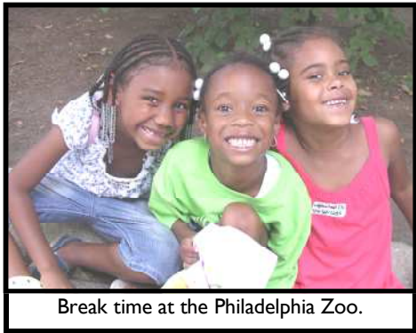
Break time at the Philadelphia Zoo.

all 115 children who attended our camp ministered to their parents and friends with their heartfelt songs, recitations of Scripture and praise dances. A skit entitled "Chair" was performed by some of the 11- to 14-year-old children who then took turns explaining that it represents the dangerous effect sin has on the lives of the people around us. Each class