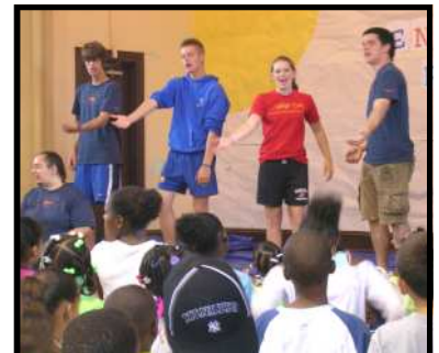
Missionaries take the stage during Summer Enrichment Program.

need to be watered by reading Scripture and praying. The seeds also need to be protected from threats around them such as birds trying to steal them and weeds overtaking them. In the same way, God's truth needs to be sheltered from those who would try to rob us of His promises and from being overtaken by lack of attention. On the last day, the children were asked to lay hands on the missionaries and pray for them. Everyone was reluctant to see them go.